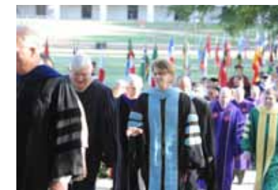
The procession to convocation officially begins every fall semester.