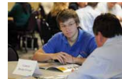
Students network with the many international companies in the region at the annual Language and International Trade Conference on campus.