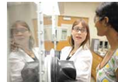
An honors student gets some lab experience the summer before her freshman year through the EUREKA! program.

Just want the cold, hard facts? See the back page.